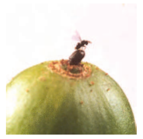
Fig. 4. Phymastichus coffea adult parasitizing an adult of H. hampei entering the coffee berry.

Also, insect nematodes are considered a good alternative to decrease the population of Coffee Berry Borer that is present in infested berries onto the ground. In Colombia, it has not