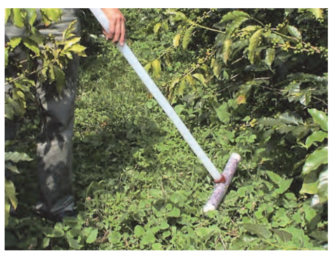
Fig. 2. Weed selector to maintain green covertures on the coffee soil to avoid erosion and favor biodiversity of beneficial fauna.

being capable of preying borer adults while attacking coffee berries. Armbrecht and Gallego (2007) also experimentally tested high predation levels of ants on H. hampei inhabiting berries on the soil.