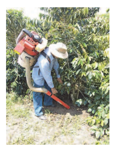
Fig. 1. Vacuum machine prototype to collect coffee berries from the ground.