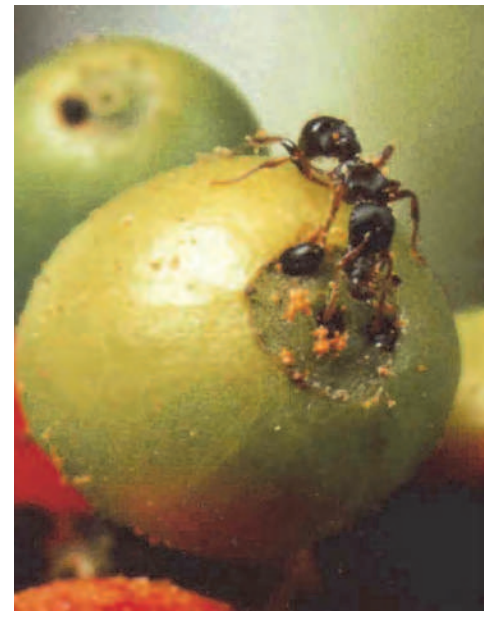
Fig. 3. Ant of the genus Gnamptogenys preying on coffee berry borer adults boring into coffee berries.

being capable of preying borer adults while attacking coffee berries. Armbrecht and Gallego (2007) also experimentally tested high predation levels of ants on H. hampei inhabiting berries on the soil.