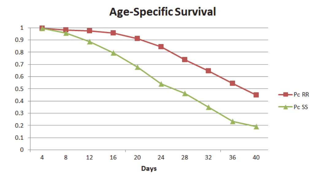
Fig. 7. Survivorship of adult Coffee Berry homozygous resistant Pc RR and susceptible Pc SS to endosulfan insecticide in lab conditions.