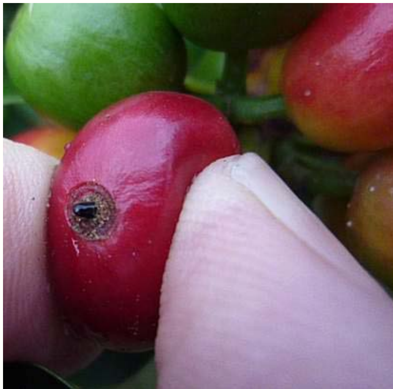
CCB in entrance hole

HC "Skip" Bittenbender, Elsie Burbano (CTAHR/UH) and Tom Greenwell and Pepe Miranda (HCA, HCGA, CBB Task Force)