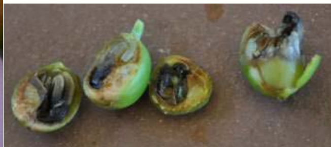
CBB already destroyed beans in green cherry