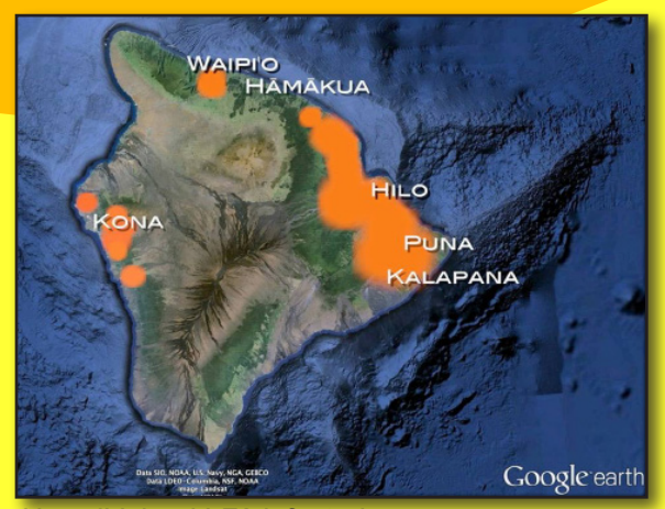
Hawaii Island LFA infested areas (2014)

LFA infest yards, houses, farms and forests. Their powerful stings harm people and wildlife. LFA sting the eyes of pets, leading to blindness. LFA damage crops, food production, and the economy everywhere they have spread. LFA alter (or impact) people's lives because their stings are unavoidable.