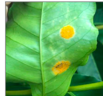
Figure 2: Close-up of powder-like coffee leaf rust spores on the underside of a coffee leaf.

threat to tree health and production. When applied properly, and at <5% infection rate of total farm foliage, contact fungicides can be helpful in protecting coffee trees from initial and increased disease severity [10]. While contact fungicides are available for Hawaii coffee producers, currently, there are no approved systemic fungicides for use in Hawaii. Physical removal, containment, and destruction of leaves and branches displaying lesions can help to reduce CLR inoculum and infection [2].